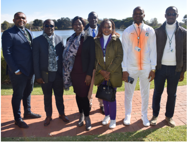
BPFC 2024: Country-team Côte d'Ivoire